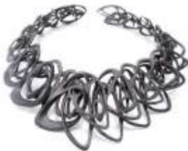
LACE BY JENNY WU 3D Printed Catana Steel Necklace