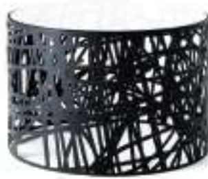
II BY IV DESIGN Scribble Table - Iconic Black