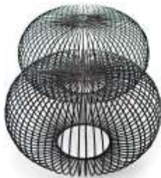
LA CIVIDINA Pioff designed by Antonino Sciortino Multi-functional Wire Chair or Table