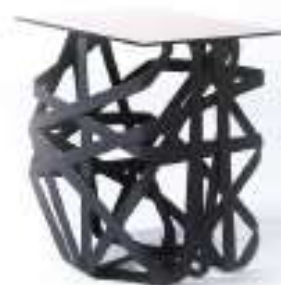
THISLEXIK Woven Rectangle Side Table