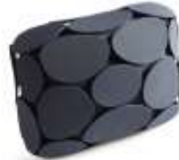
MAISON 203 3D Printed Ivy Clutch