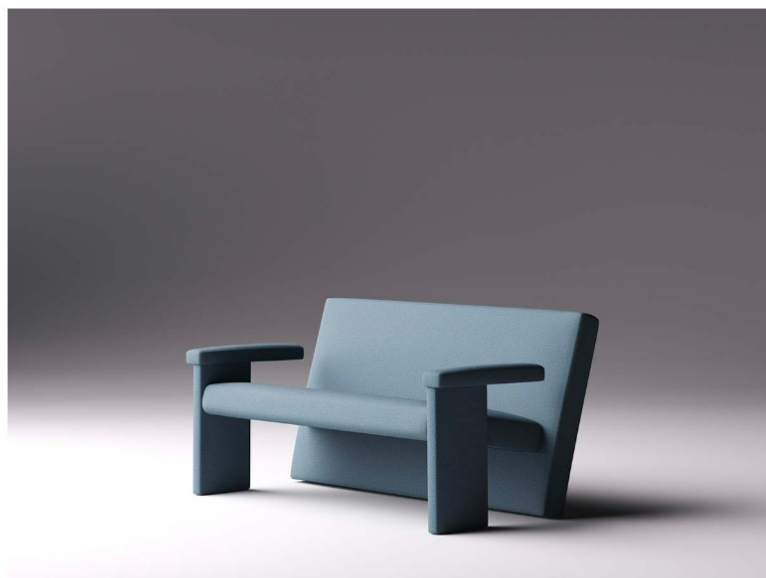
Agetti by LaCividina, design Garcia Cumini

Clear and understated, the Agetti family has restrained, sculptural volumes, for effective insertion in both residential and commercial contexts. Slim shapes and vivid stitching are accompanied by the “controlled” softness of the upholstery, in various armchair and sofa versions. With Agetti LaCividina takes its manufacturing ability, technological excellence and fine craftsmanship to the highest levels: the stitches run perfectly straight along the lines, the reinforced elastic belting is also inserted in the back for greater comfort, while the fabrics become protagonists, matched with a solid beech structure that follows the rules of the Friuli style of upholstered furnishings.