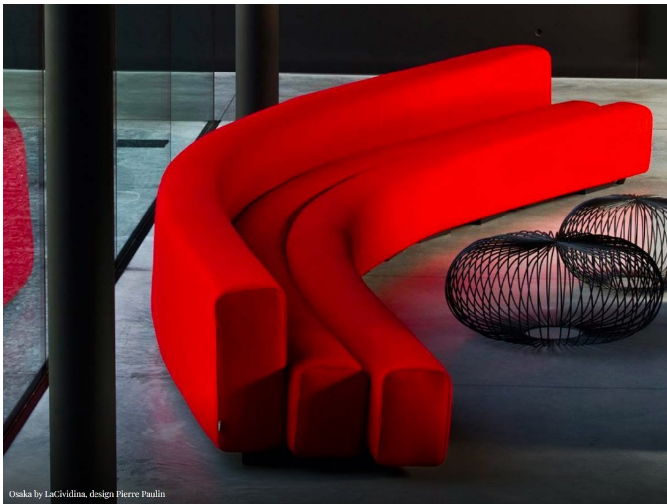
Osaka by LaCividina, design Pierre Paulin

The brand's first showroom opens on 18 April, with projects from 50 years of history