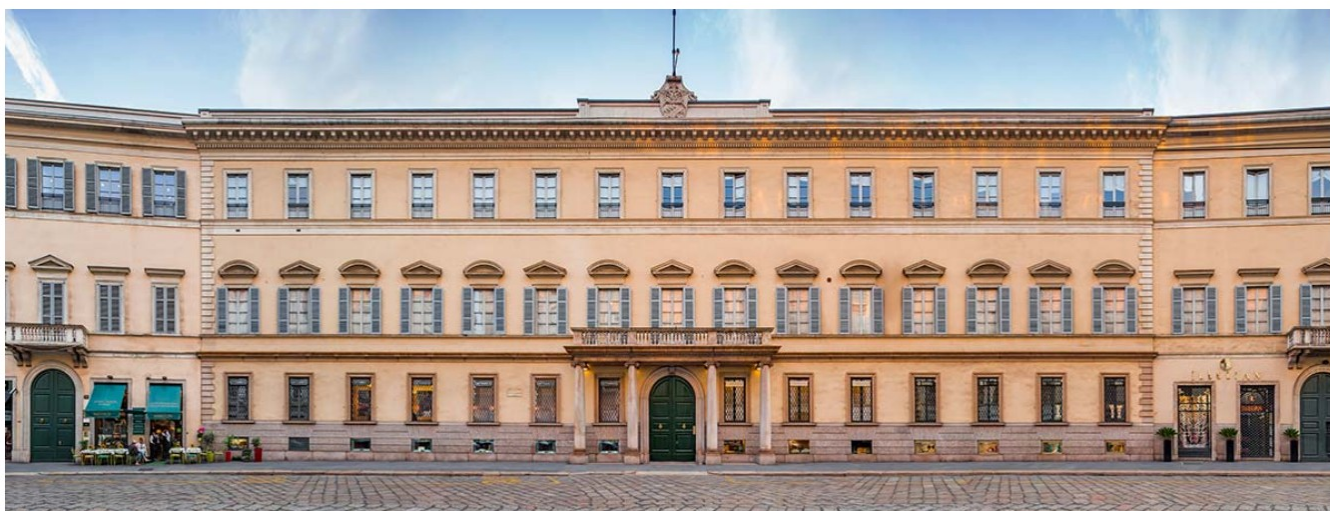
Palazzo Borromeo d'Adda, Milan